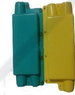
Silicone Rubber Cover CRHZ